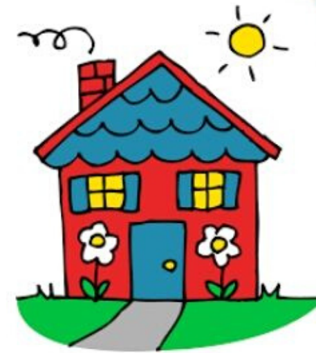
Staying at home if I feel sick

Just like any other cold or flu Coronavirus will go away in a couple of months