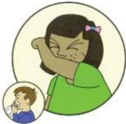
Coughing & sneezing into my elbow