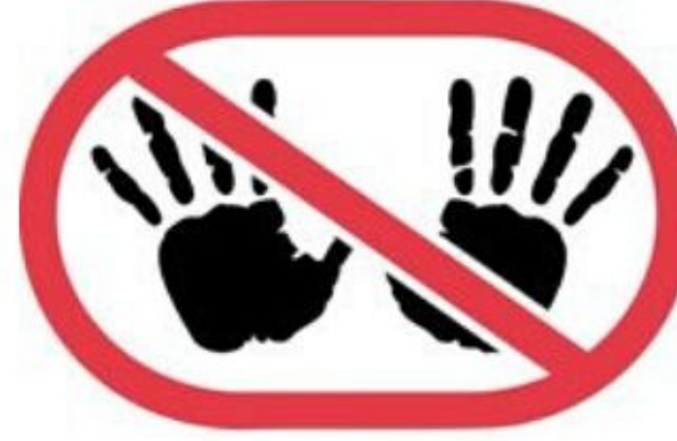
Trying not to touch outside doors, handles, railings