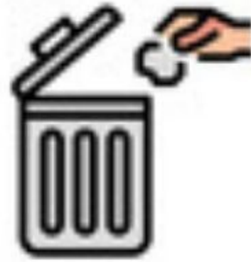
Putting used tissue in the bin