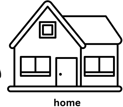
The doctor will put stickers on the small containers and put them in a special bag. When this is done, it is time to go home.