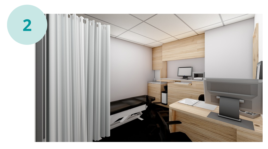
When I need to have a blood test, I visit the doctor.