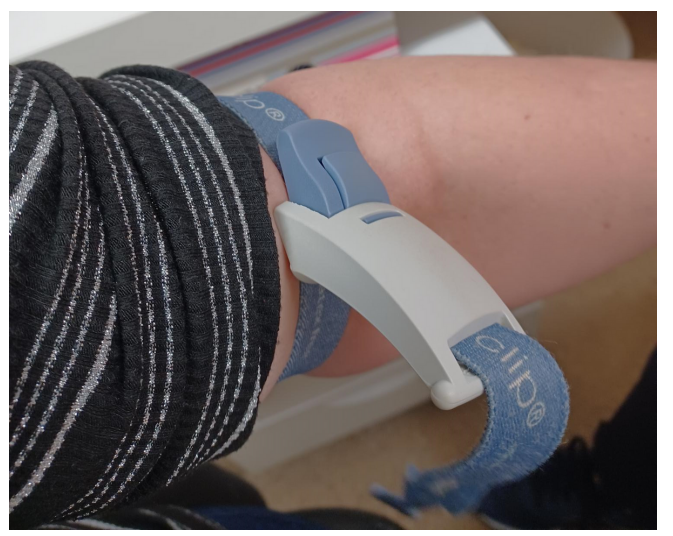
The doctor will put a small belt called a tourniquet on my arm.