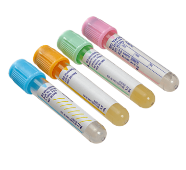
The doctor will collect the blood in a small container. Sometimes, they need to collect 2 or even 3 small containers.