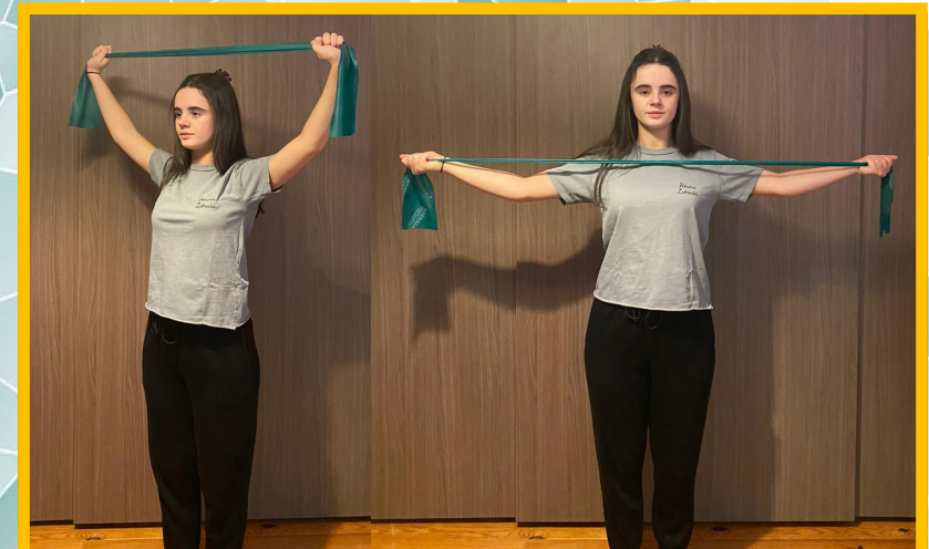
Lat Pull Down