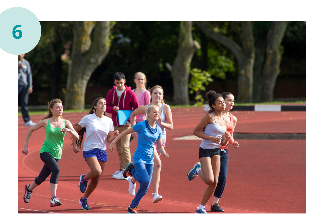
I will not do my usual schoolwork. I will be running in races and watching others.