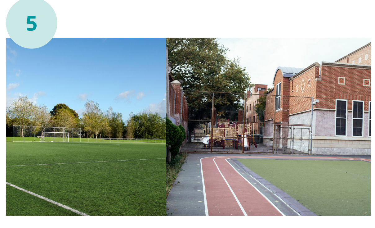
I will not be in my classroom all day. I will be on the sports pitch or playground.