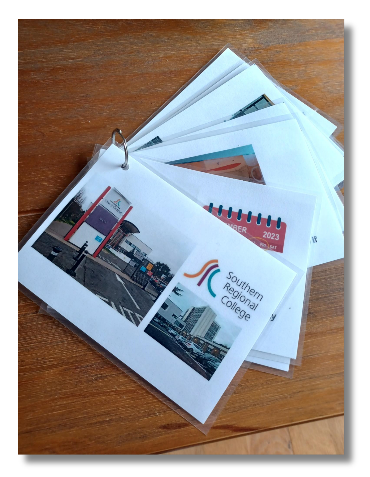
Transitioning to Further Education

Example of a bespoke personalised resource